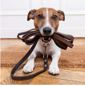
I'm Just a Dog Walker