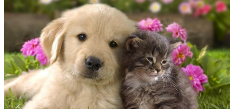
The Life of a Professional Pet Care Specialist