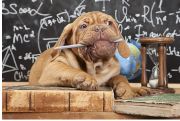
Professional Pet Care Specialists and Continuing Education