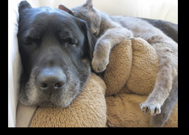
Care for Senior Dogs