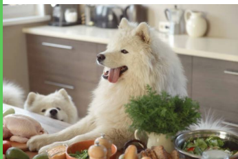
Diets and Nutrition for Disease Care