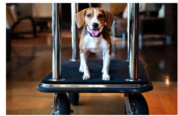
Where to go During Emergencies