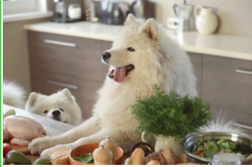
Diets and Nutrition for Disease Care