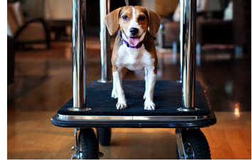
Where to go During Emergencies