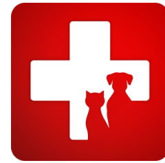
Pet First Aid and Emergency Techniques