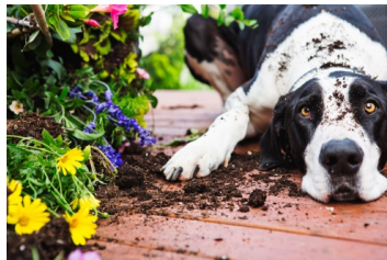
Poisonous Yard Items