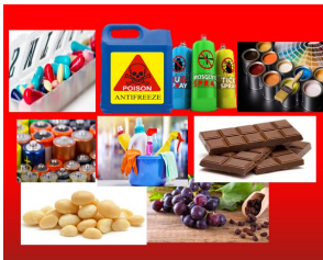
Poisonous Items to Pets