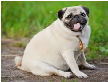
Pet Obesity and Weight Loss