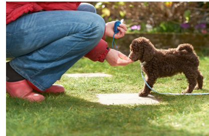
How to Find a Positive Based Trainer