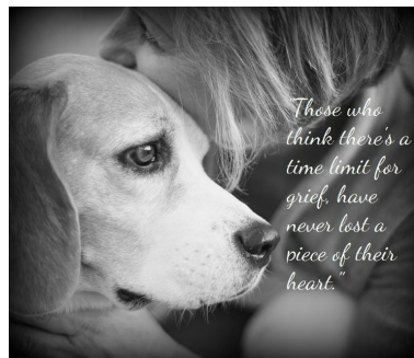
Pet Care Specialists and Grief