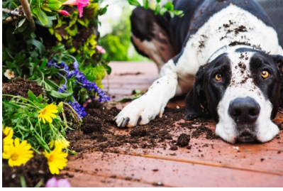
Poisonous Yard Items