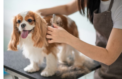
How to Choose a Groomer