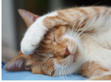
Upper Respiratory Infections in Cats