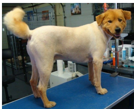
The Danger of Shaving Your Pet