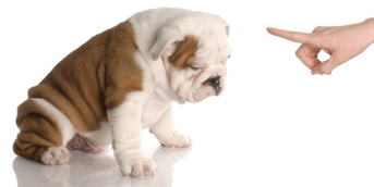
The Dangers of Choosing The Wrong Dog Trainer