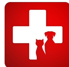
Pet First Aid and Emergency Techniques