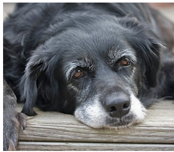
Behavioral Changes in Senior Pets