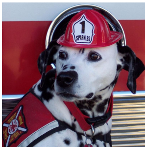
Emergency Evacuation Plans for Pets